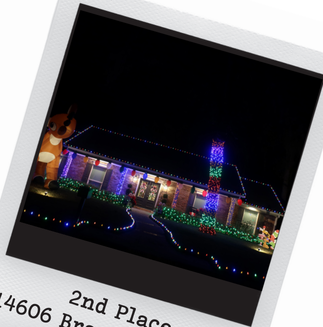
2nd Place 14606 Bramblewood Dr.