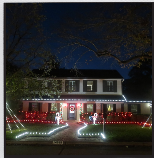
3rd Place 14615 Oak Bend Dr.